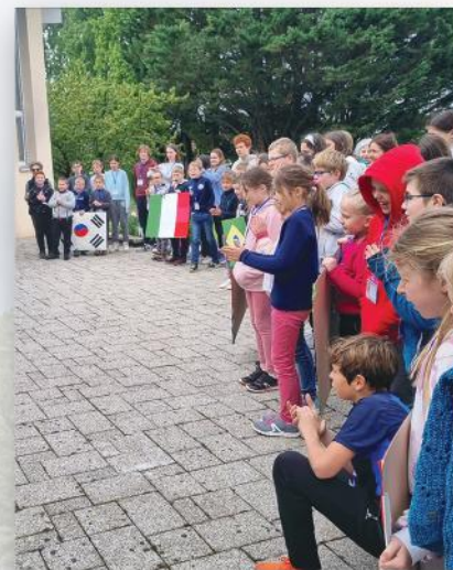
CEF France hosting a "Sports Day" club to reach children with the Gospel.