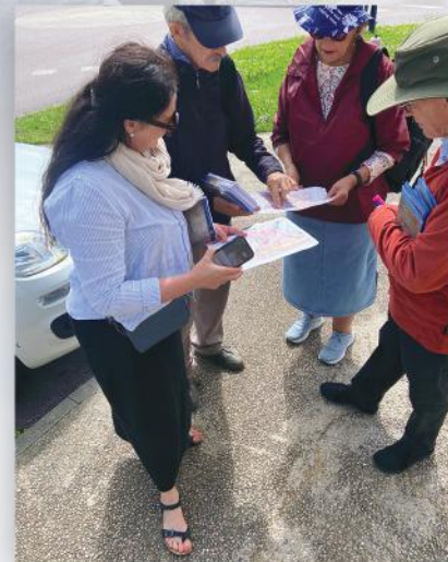
CEF workers and volunteers plan literature distribution as they look at maps of areas where the Olympic torch will pass.

The overwhelming amount of CEF workers, volunteers, churches, and teens who shared the Gospel is a testament to their passion and love for people. The Olympics outreach not only touched the thousands of people who received the Gospel literature or participated in a Sports Day club but will continue to touch thousands of lives as the effects of our ministry live on in France and other countries around the world.